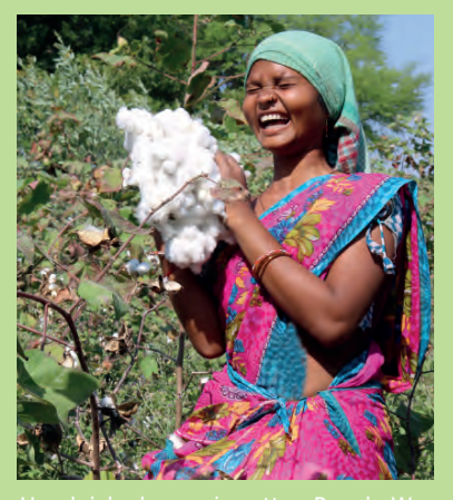
Handpicked organic cotton People Wear Organic